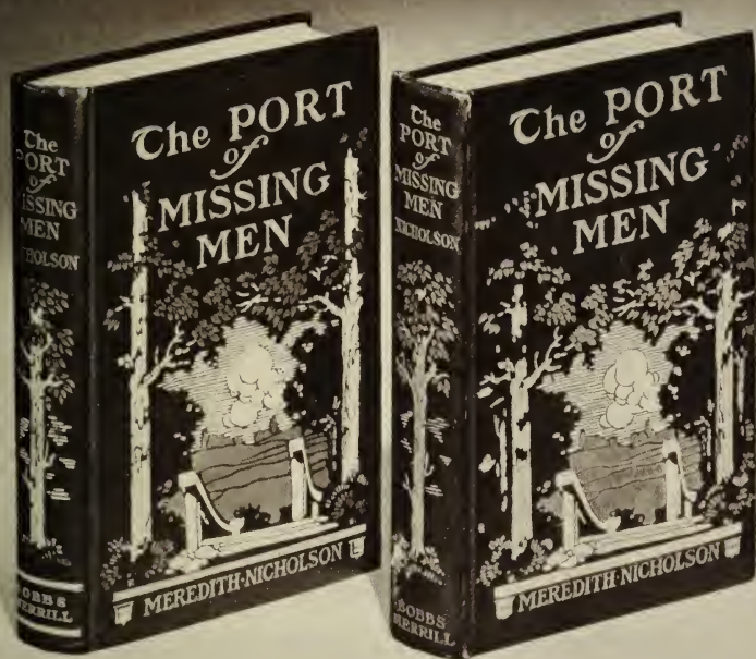
THE PORT OF MISSING MEN in first and second states of binding