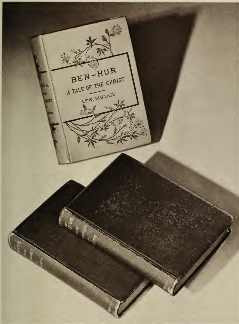
Lew Wallace's BEN-HUR in flower-stamped cloth and in later undecorated bindings; all first edition copies