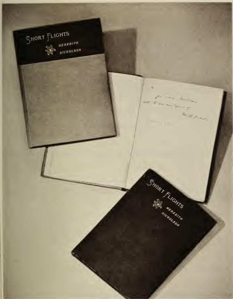
Meredith Nicholson's first book, SHORT FLIGHTS: the two bindings and a presentation inscription